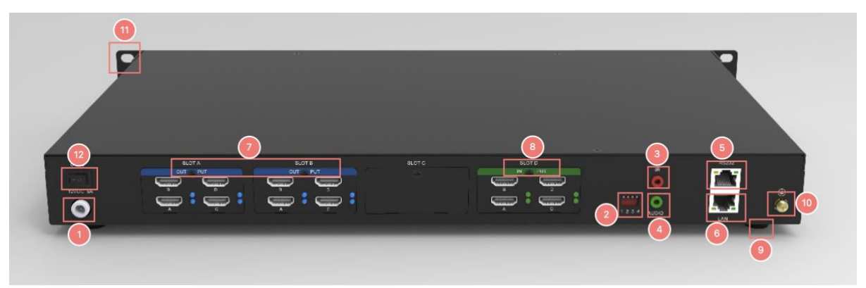
Model: iWall X408